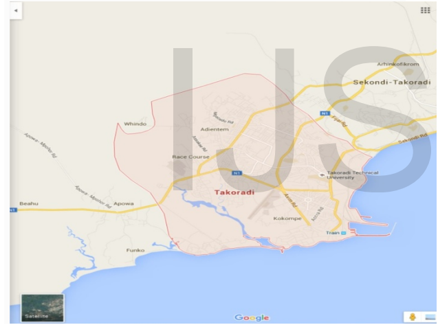
Figure 1; Shows the map of the study area (STMA)

Sekondi-Takoradi Metropolitan Assembly (STMA) is the administrative capital of the Western Region of the Republic of Ghana and covers a land area of 219km2 with Sekondi as the administrative headquarters. The Metropolis as shown in Figure 1 is bordered to the west by Ahanta West District, to the north by Mpohor Wassa East District, to the east by Shama District and to the South by the Gulf of Guinea. The Metropolis is located on the south-western of Ghana, about 242km west of Accra, the capital city. It is also approximately 280 kilometres from the La Cote d'voire border in the west.